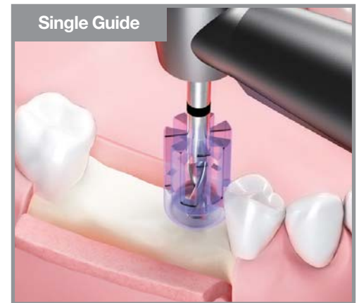
Single Guide enables correct measurement through close attachment